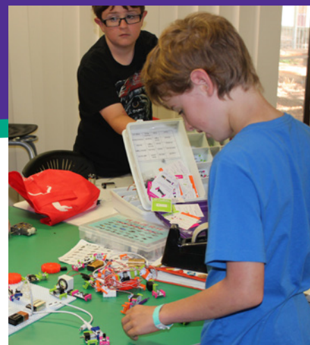
Clubhouse Members experimenting with LittleBits.