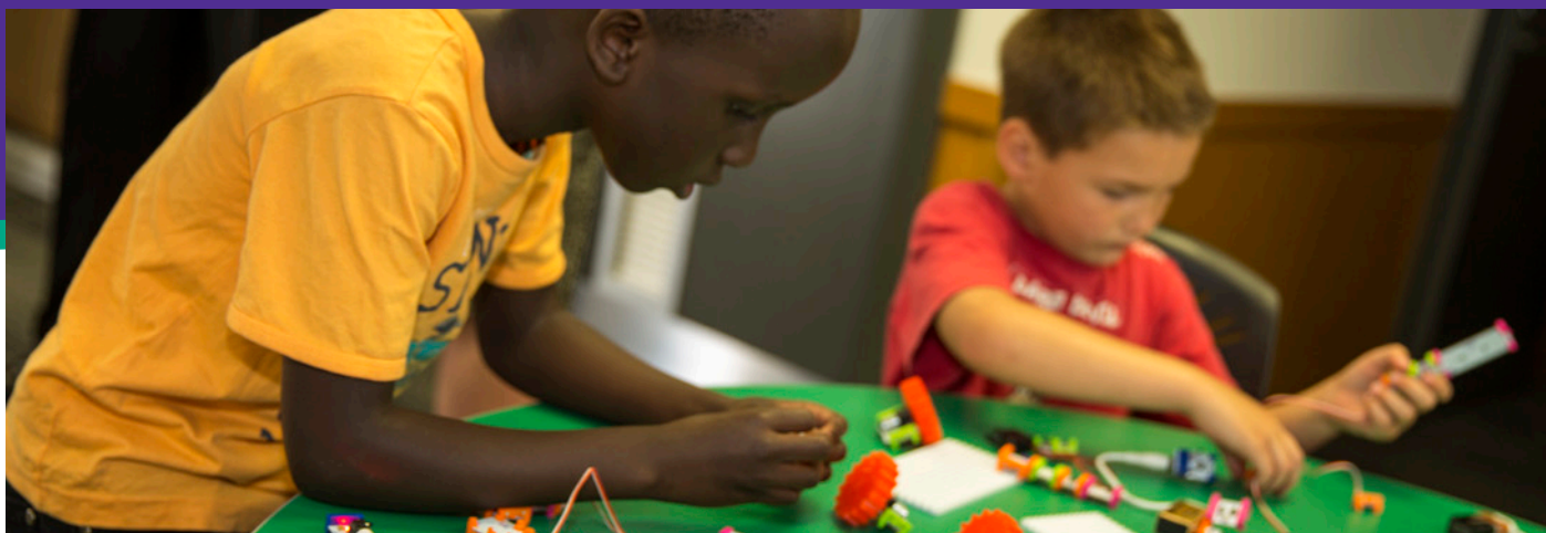
Clubhouse Members working with LittleBits.

The Computer Clubhouse is a high tech digital studio where Tuggeranong youth collaborate with industry mentors to design, create, and pursue their passions.