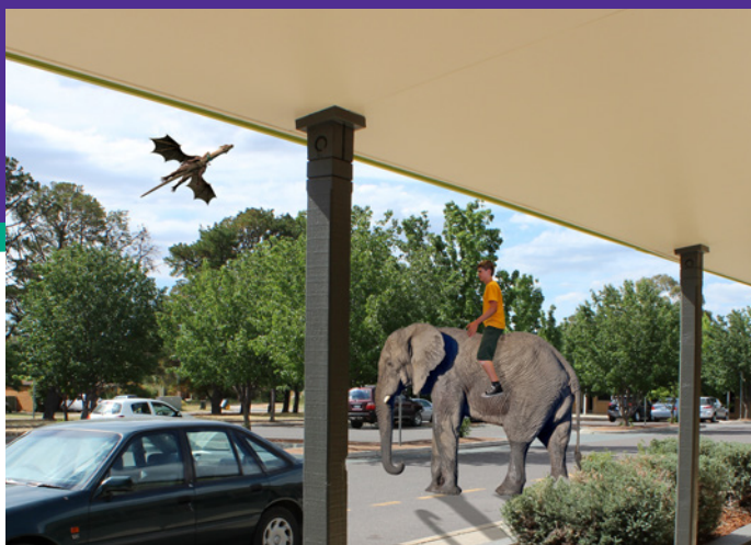
Clubhouse members are loving using Photoshop Elements to photoshop wild creatures into everyday landscapes, like the Clubhouse carpark!

The Computer Clubhouse is a high tech digital studio where Tuggeranong youth collaborate with industry mentors to design, create, and pursue their passions.